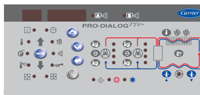
Pro-Dialog Plus operator interface